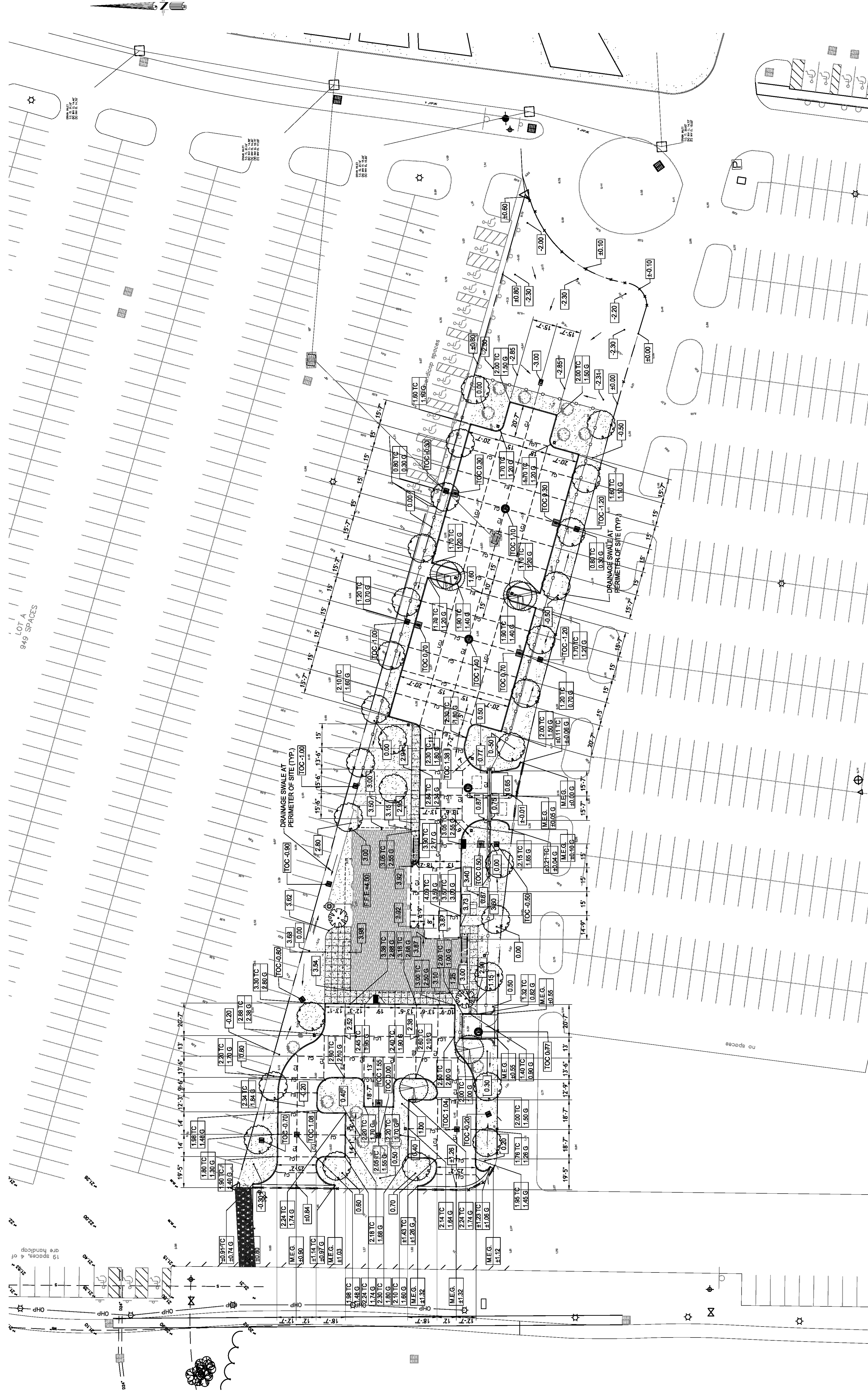
3 PAVING AND GRADING PLAN C3 1"=30' NORTH GRAPHIC SCALE 1"=30'