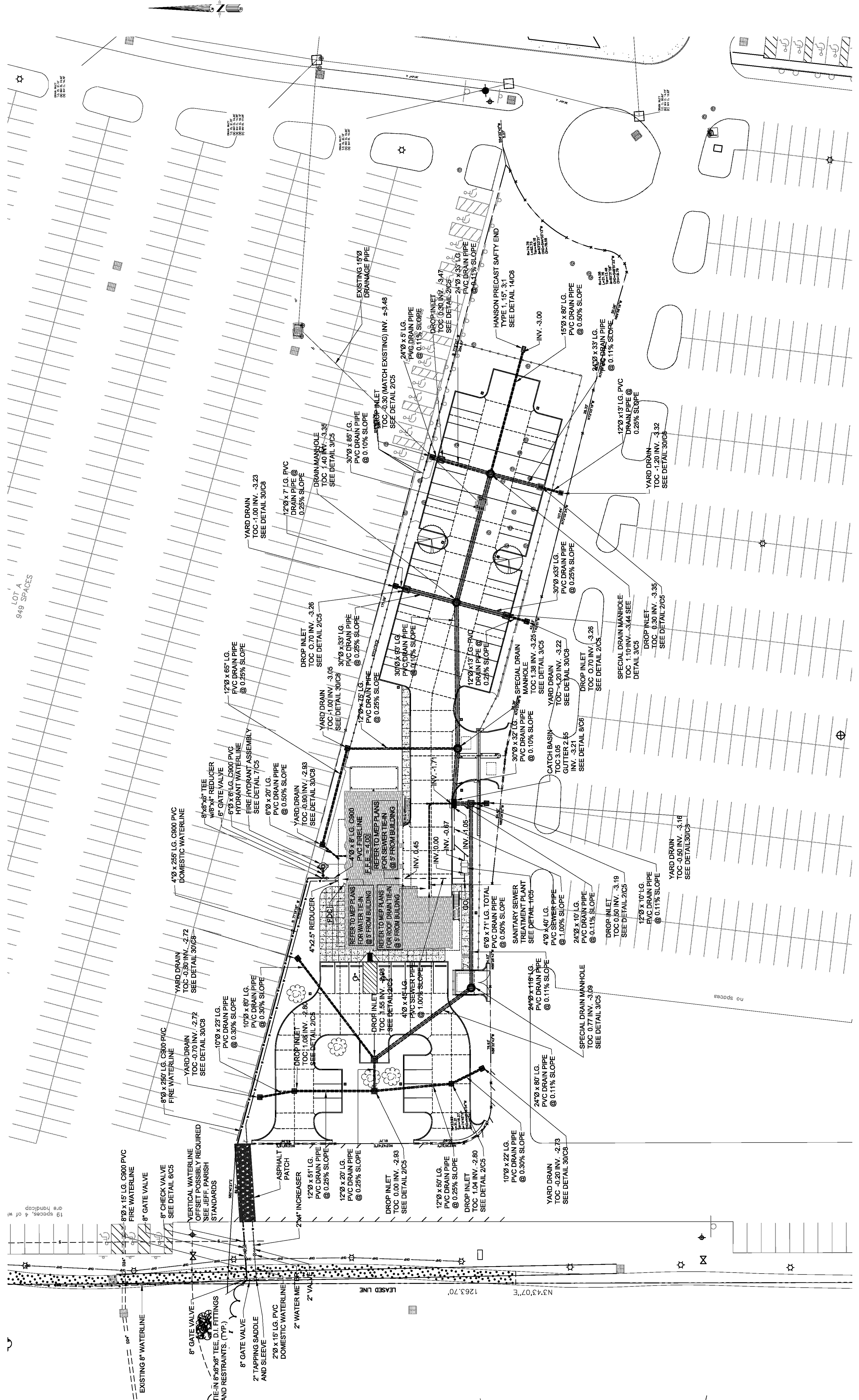
4 C4 UTILITIES PLAN 1"=30'